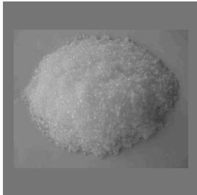
Calcium Magnesium Acetate