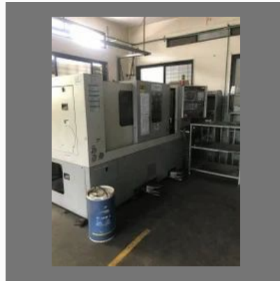
CNC Job Work Upto 700mm Length