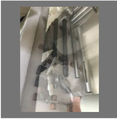
All Lathe Works