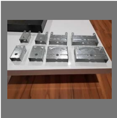
Press Machine Works