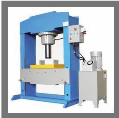
JB Engineering Hydraulic Power Press Machine