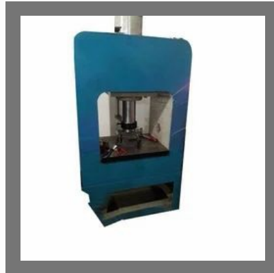
Hydraulic Power Press Machine