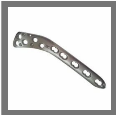
Tibiya Locking Orthopedic Locking Plates