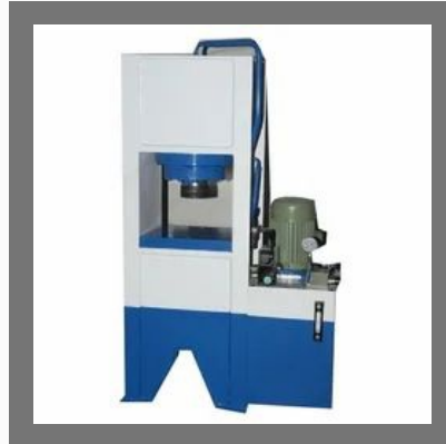
Cement Block Hydraulic Press Machine