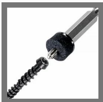
Cortex Screw star hex & punch