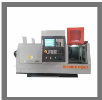
CNC Sliding Head Machine