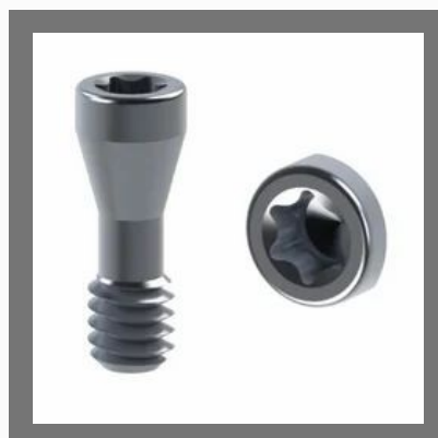
Titanium Abutment Screws star hex & Punch