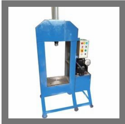
Orthopedic Nail Clamping Hydraulic Press Machine