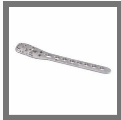
Proximal Humeral Orthopedic Locking Plates