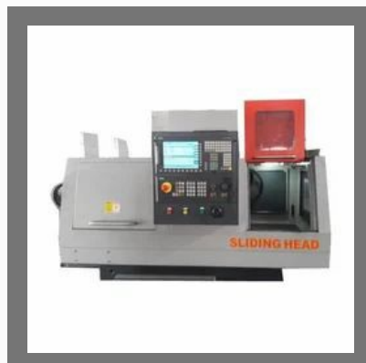
Electric CNC Sliding Head Machine