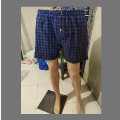
mens boxer shorts