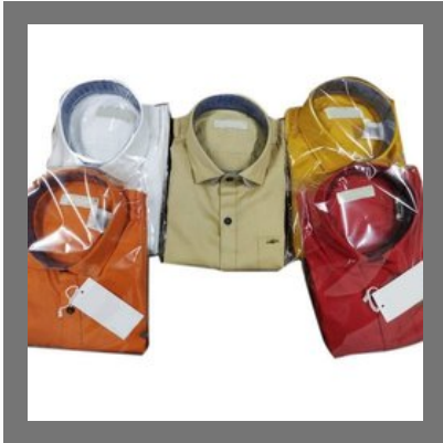
Mens Cotton Plain Shirt