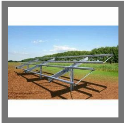
Solar Panel Structure