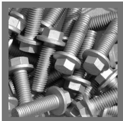
Zinc Coating Services