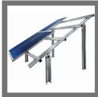
Solar Module Stand