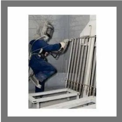
Spray Galvanizing Services