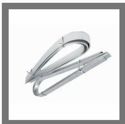
GI Strip And Earthing Strip