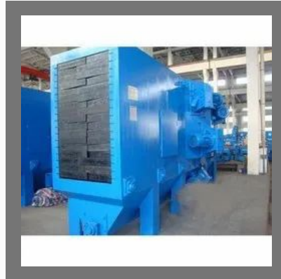
Converted Shot Blasting Service