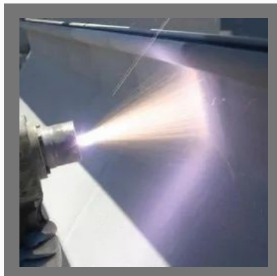
Zinc Spray Metalizing Services