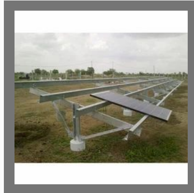
Solar Panel Mounting Structure