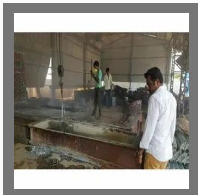
Industrial Spray Galvanizing Services