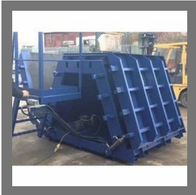
Drainage Precast Concrete Mould