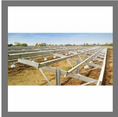
Solar Module Mounting Structure