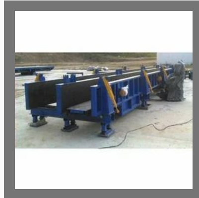
Beam Steel Mould