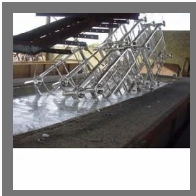
Hot Dip Galvanizing Services