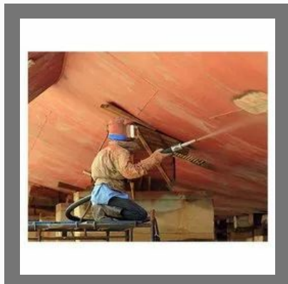
Industrial Copper Slag Blasting Services