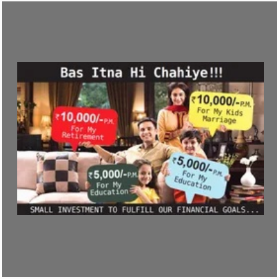
AMFI Registered Mutual Fund Distributor