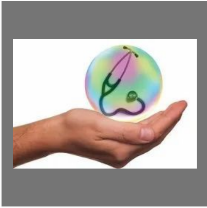
Health Insurance Service