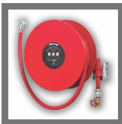
Fire Hose Reel