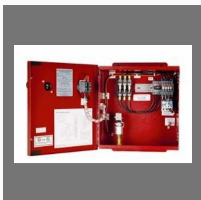
Fire Pump Controller