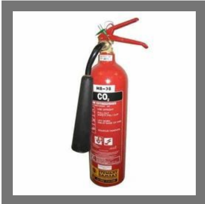
Gas Fire Extinguisher