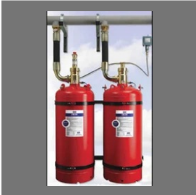
FM-200 Fire Suppression Systems