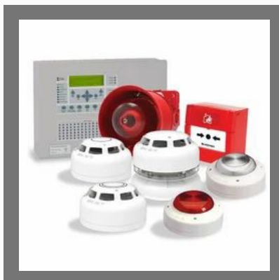
Fire Detection Alarm System