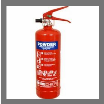
Dry Powder Fire Extinguisher