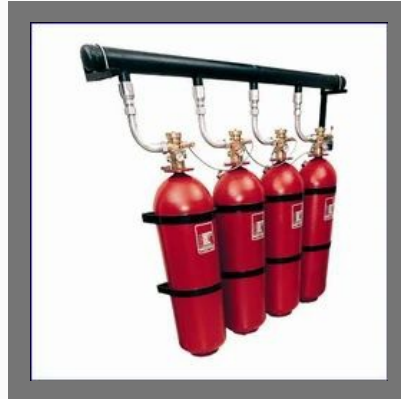
Co2 Suppression System