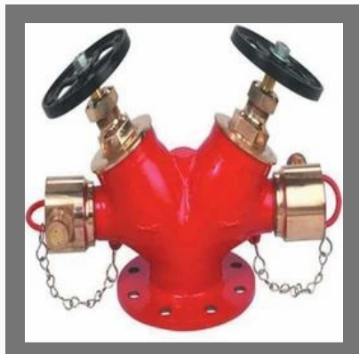
Fire Hydrant Valve