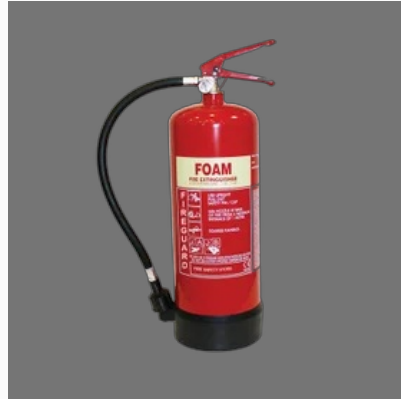
Foam Fire Extinguisher