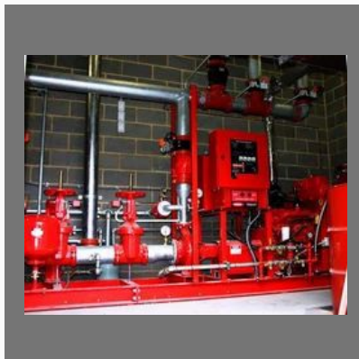
Industrial Fire Hydrant System