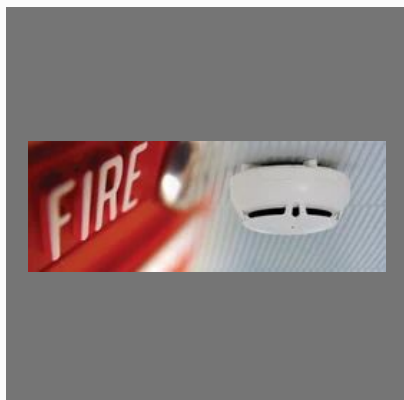
Fire Alarm System