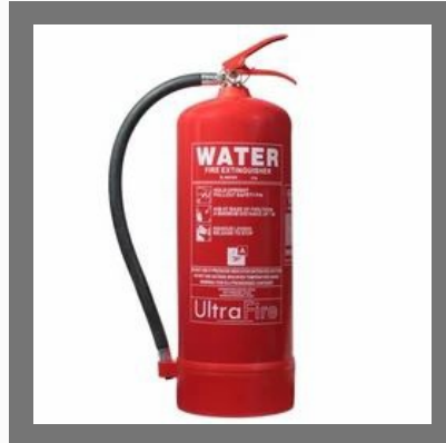
Water Fire Extinguisher