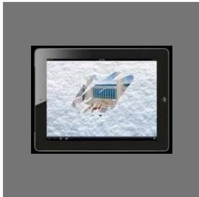
Custom Ad Unit Development