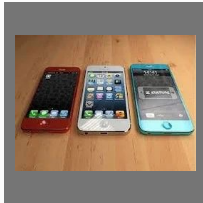
Creative Concepts Mocks