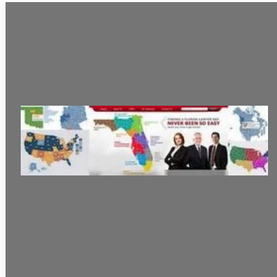
Custom Flash HTML5 Development.