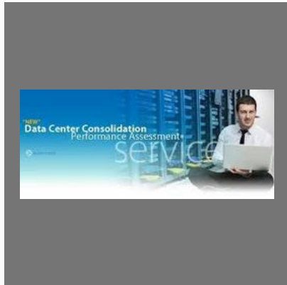
Managed Service For Ad Production