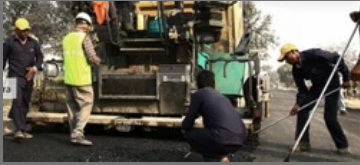
JKM Infra Projects