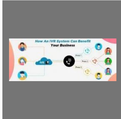
IVR System Solution Service