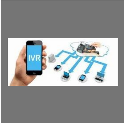
Hosted Ivr Services