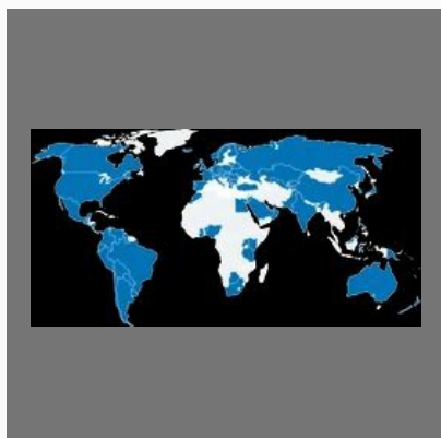
99.5% Uptime Sla 24x7 International Toll Free Number Service