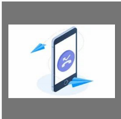
Missed Calls Service Provider