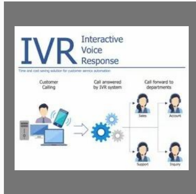
IVR (Interactive Voice Response) System Solution