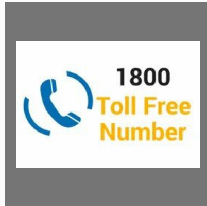
Domestic Toll Free Number Service