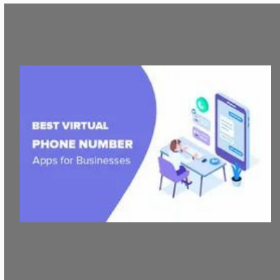
Virtual Number IVR Service