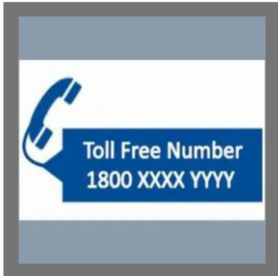
Toll Free Number Service