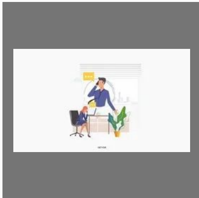
Click To Call