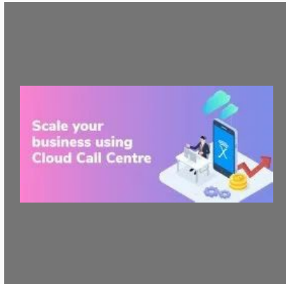
Hosted IVR Services