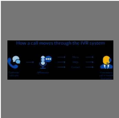
Cloud IVR Solutions