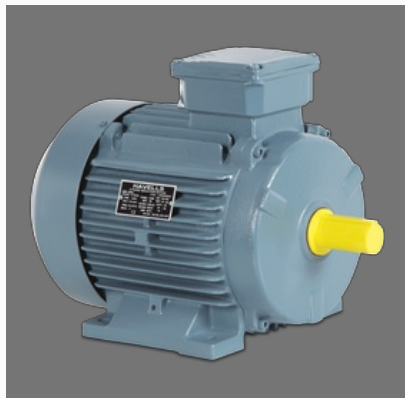
Three Phase Induction Motor