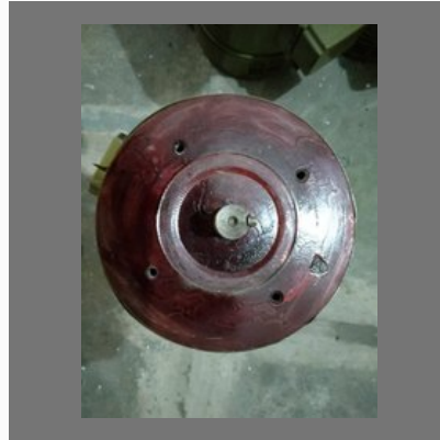
Vertical DC Motor