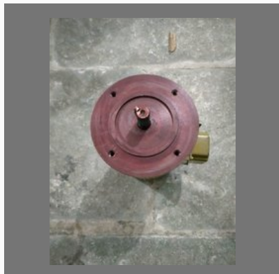
Vertical Electric DC Motor