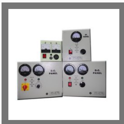
DC Electric Panel