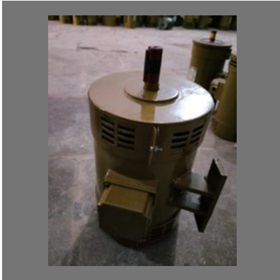
1500 RPM DC Motor