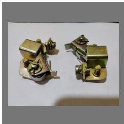
Carbon Brush Holders