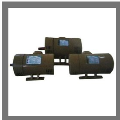
Electric DC motor