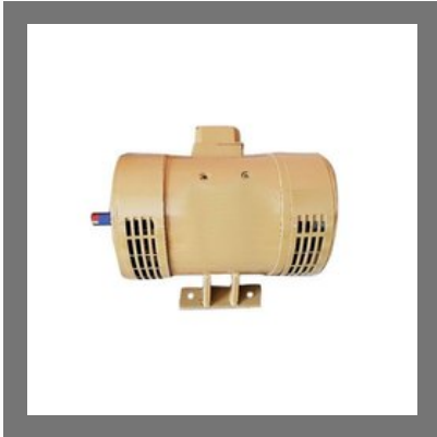
DC Shunt Motor