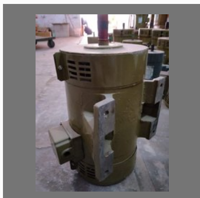
3hp Slipring Motor Elmo Brand