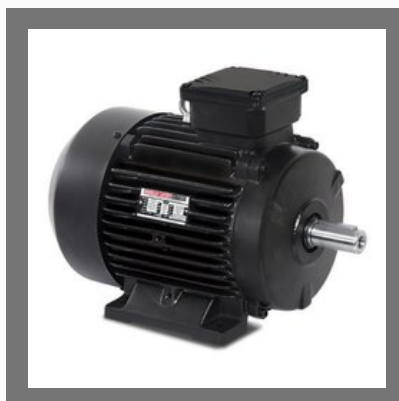
Havells MHKXTJS605X5 Foot Mounted Motor