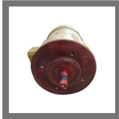
1HP/230V/VARTICAL DC MOTOR