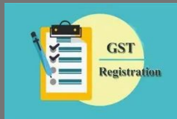
GST Registration Consultants