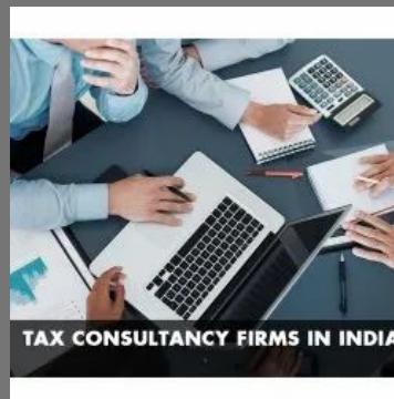
Income Tax Consultancy Service