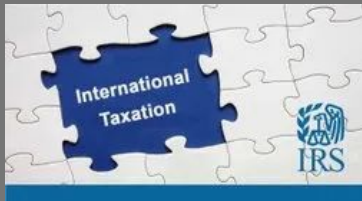
International Taxation Service