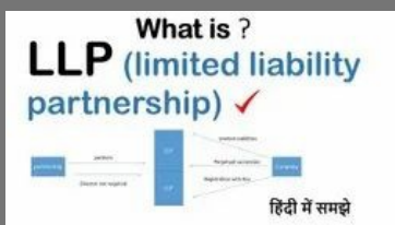
LLP Formation Service