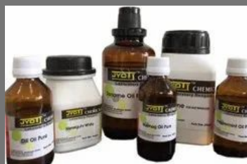
Ferrous Ammonium Sulphate