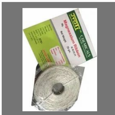
Magnesium Metal Ribbon