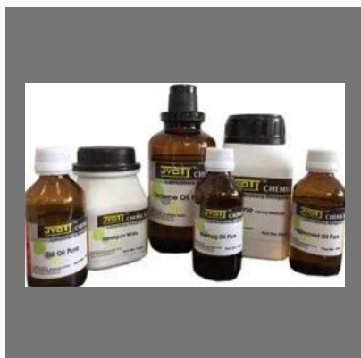
Fehling Solution B