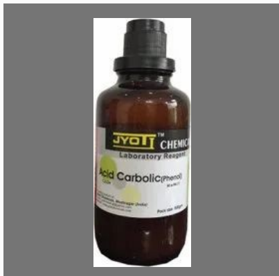
carbolic acid liquid