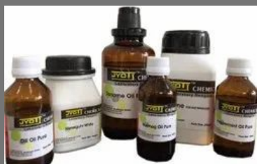
Sodium Hydroxide Pellets