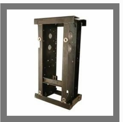
Precision Sheet Metal Fabrication