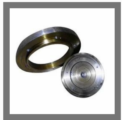
Mild Steel Circular Cutting Die