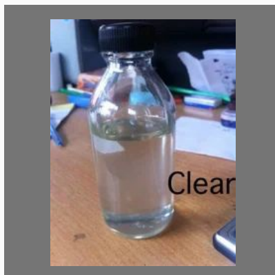
Roof Light Resin