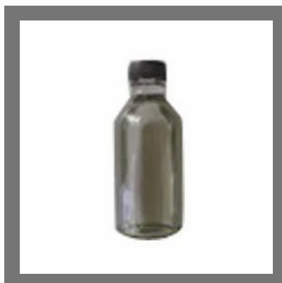
Gel Coat ,