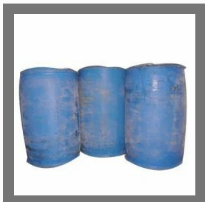
Unsaturated Polyester Resin