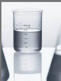
Gp Resin Polyester Resin