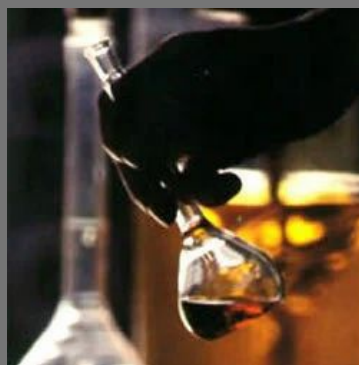
General Purpose Resin