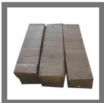
Fiber glass Mat