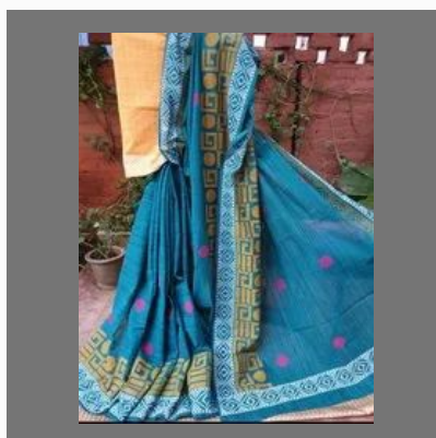
Pure Handloom Cotton Sarees