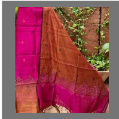
Hand-Dyed And Handblock Printed Tussar Silk Suits