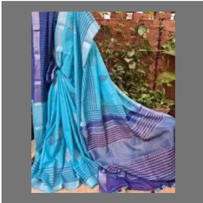
Handblock Printed Cotton Linen Saree