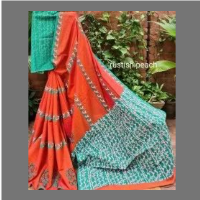
Block Print Saree