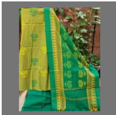
South Cotton Handblock Printed Suits