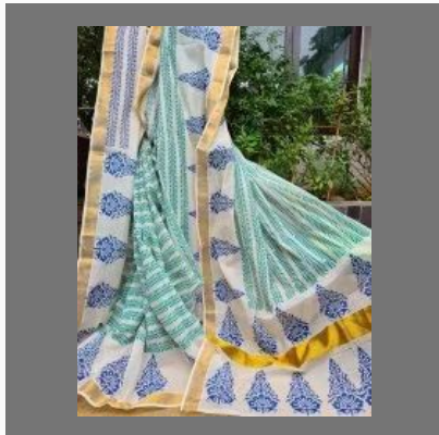
Handblock Printed Kerala Cotton Saree