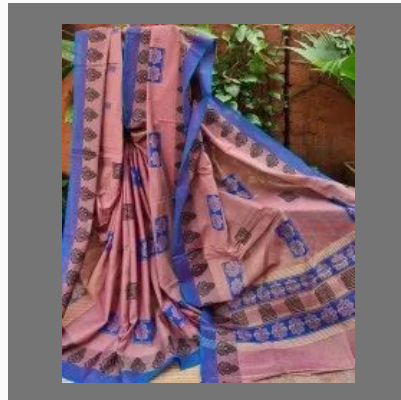
Handblock Printed Woven Border Pure Cotton Sarees with Blouses