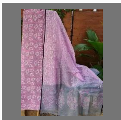
Chanderi Cotton Suits Pure Cotton Kota Dupattas