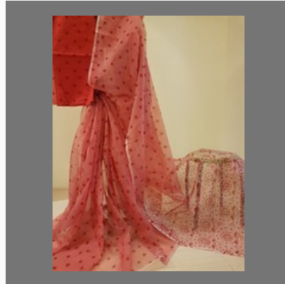
Hand Block Printed Sarees