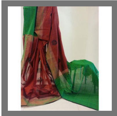
Combination Silk Saree