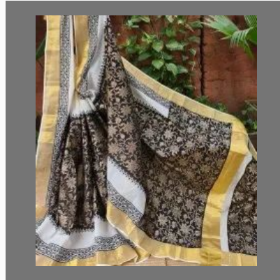
Kerala Cotton Block Printed Sarees