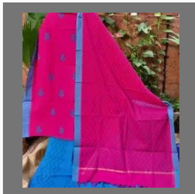
Printed South Cotton Suit