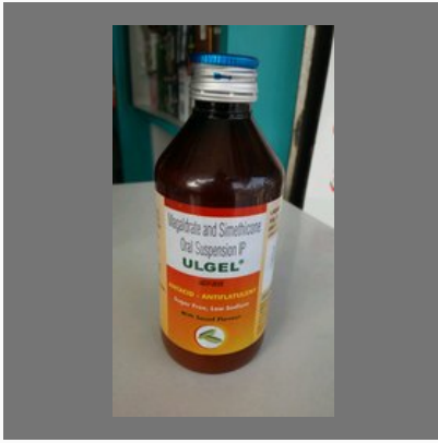
Magaldrate And Simethicone Oral Suspension Ip