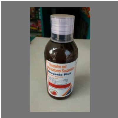
Ibuprofen And Paracetamol Suspension