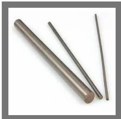
Copper Tungsten Electrodes