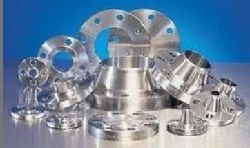
Stainless Steel Flanges