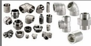
Buttweld Pipe Fittings