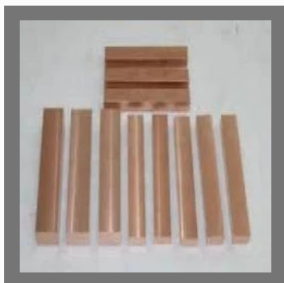
Tungsten Copper Blocks