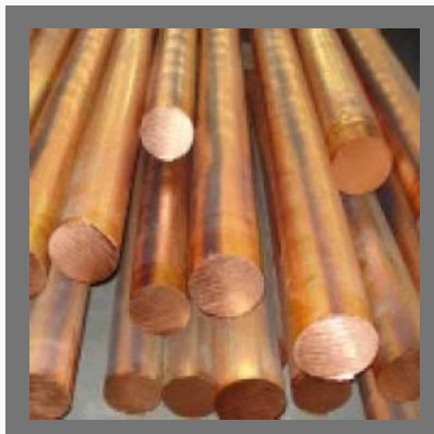
Tungsten Copper Round Bars