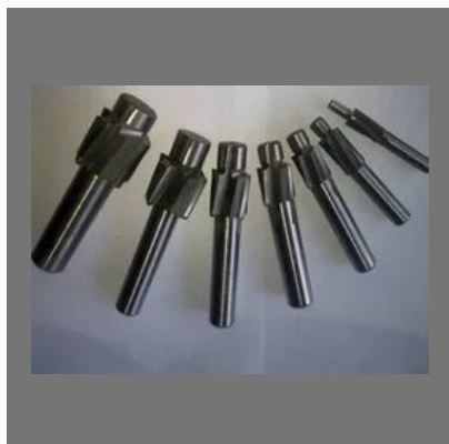
Counter Bore Cutter