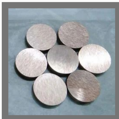
Projection Welding Electrode