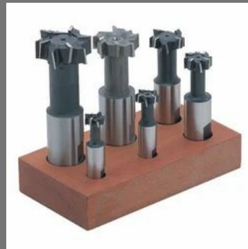
T Slot Cutter