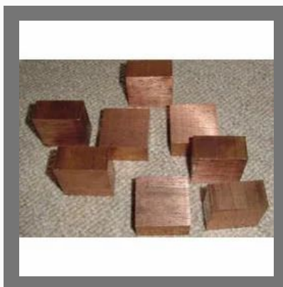
Copper Tungsten Blocks