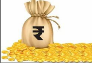
Corporate Fixed Deposits