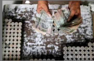
Solve Mutual Fund Query