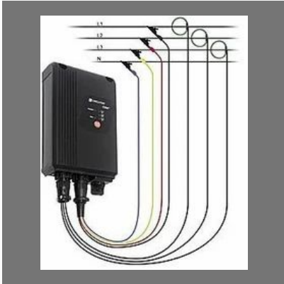
Power Quality Audit