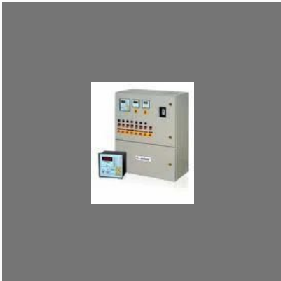
Power Factor Control Panel 30-3000 Kvar