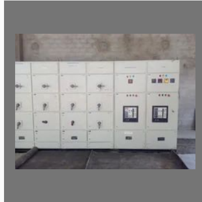
Electrical Panel Board