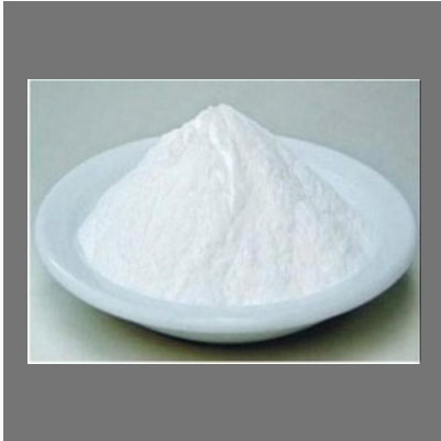
Zinc Stearate Fusion Grade (Transparent)