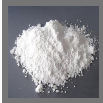
Tribasic Lead Sulphate