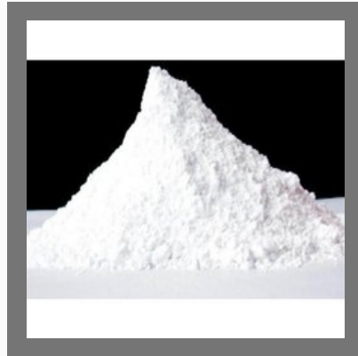
Dibasic Lead Stearate