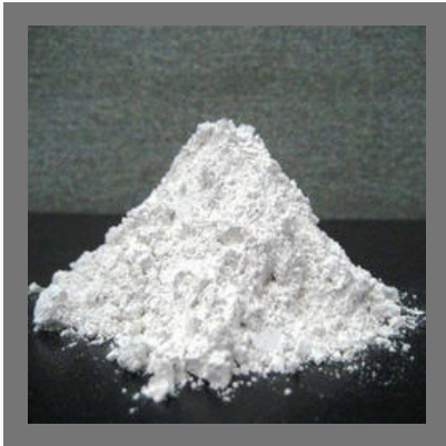
Hydrated Lime Powder