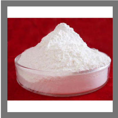
Bisphenol A - BPA