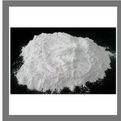
Calcium Zinc Stabilizer