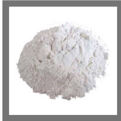
Thermal Powder / Booster (Reprocessed Chemical)