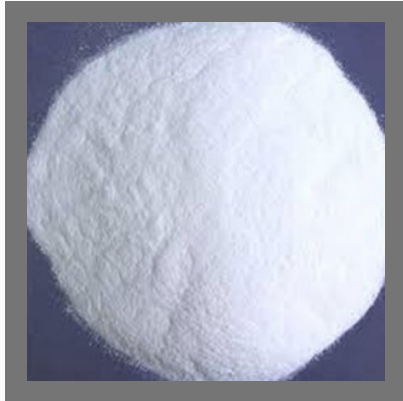
Di Basic Lead Stearate (D.B.L.S.)