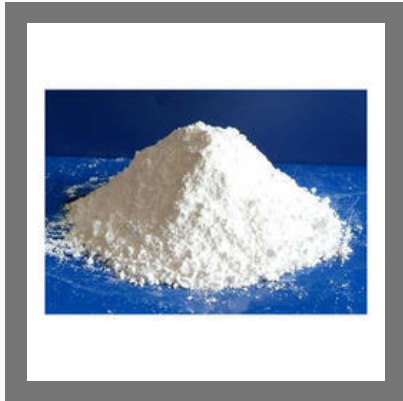
PVC One Pack Stabilizers