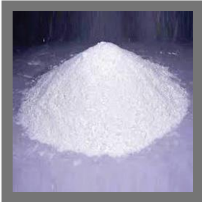
Zinc Oxide - White Seal