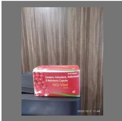
Lycopene Multivitamin Multimineral Antioxidant Capsules