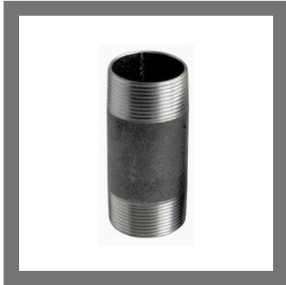
MS Barrel Nipple