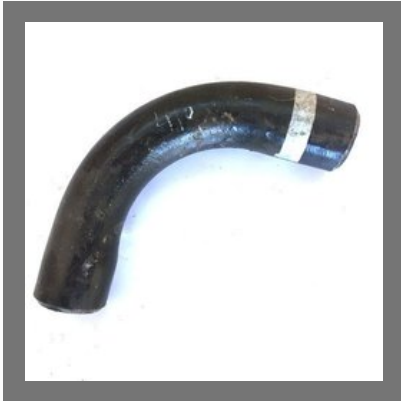
MS Long Bend