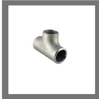
MS Seamless Tee