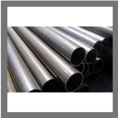
Mild Steel Seamless Pipe MSL