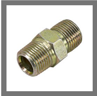
Hydraulic Hex Nipple