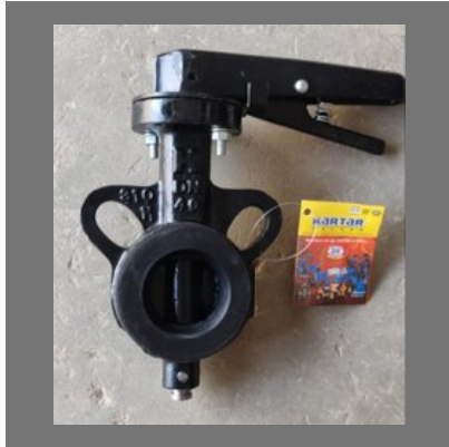
CI Butterfly Valve KARTAR