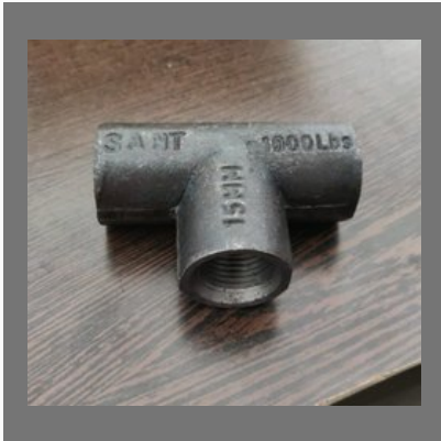
Forged Tee "SANT"