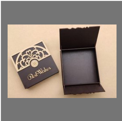
Wooden Gift Box