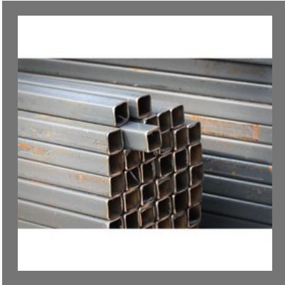
MS Square Pipe TATA, ASIAN, JINDAL