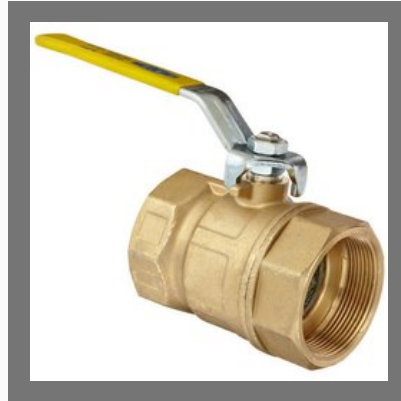
Brass Ball Valve