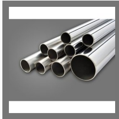
304 Stainless Steel Pipe