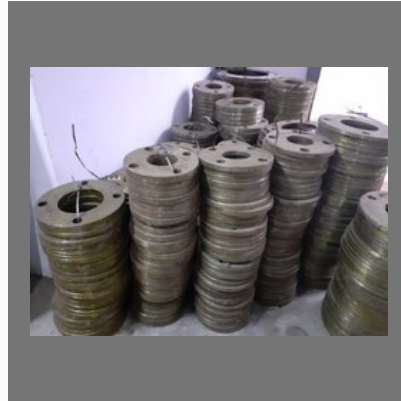
Round MS Flange SORF Polished