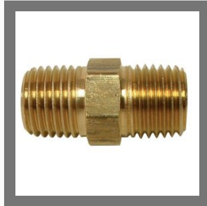
Brass Hex Nipple