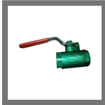
Cast Iron Ball Valve