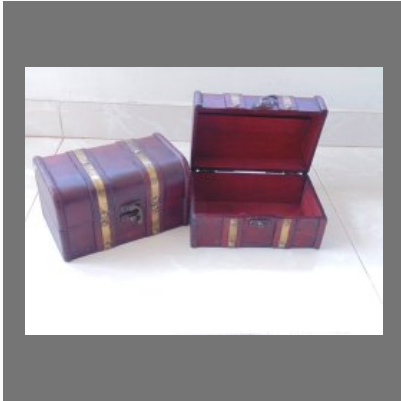
Wooden Box Vintage Type