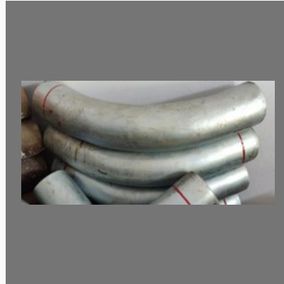
GI Long Bend 6"