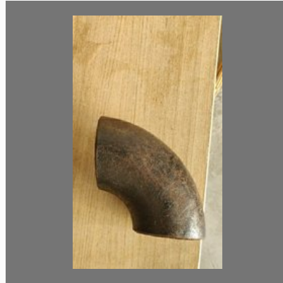
Mild steel Elbow