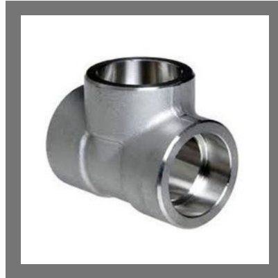
Ms Forged Socket Welded Tee