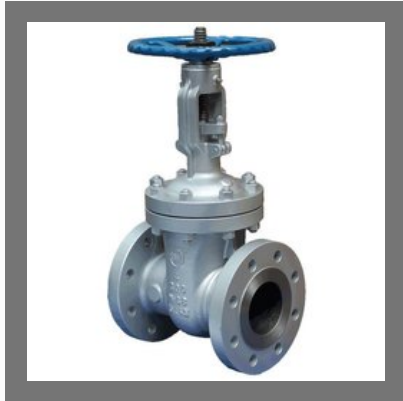
Cast Iron Globe Valves IBR