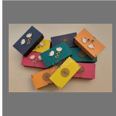
Combo Gift Boxes 5 pieces