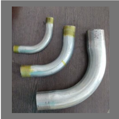
GI Long Bend