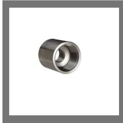
Forged Coupling (Forged Socket)