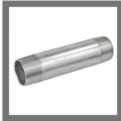
Stainless Steel Pipe Nipple