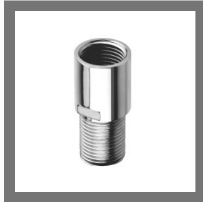
CP Extension Nipple