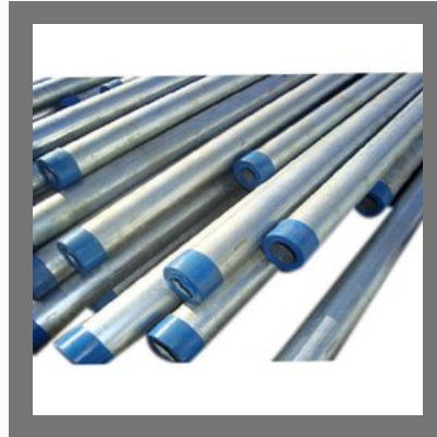
Galvanized Iron Pipes TATA, JINDAL, ASIAN