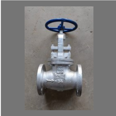
WCB Globe Valve Flange End 150 Class