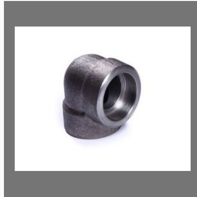
Forged Socket Weld Elbow