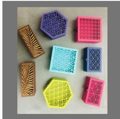
Wooden Handcrafted Boxes