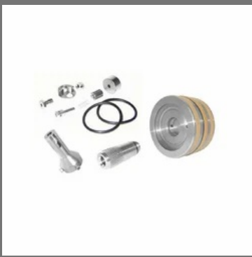
KMT H2O Quality Components For Waterjet Cutting