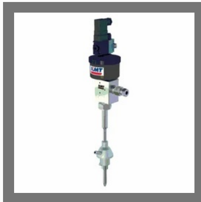
Active Autoline II Waterjet Cutting Head