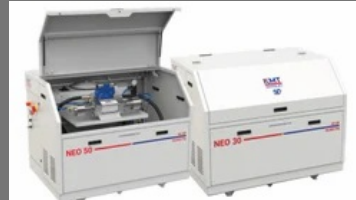
NEO Series 50 & 30 HP