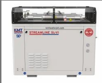
Streamline VI 50