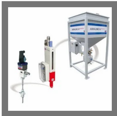
AMS V - Abrasive Management System