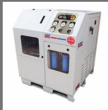
Triline TI-i 30 Water Jet Cutting Machine