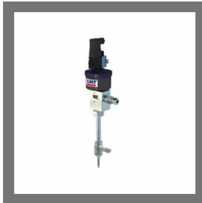
Active IDE II Waterjet Cutting Head