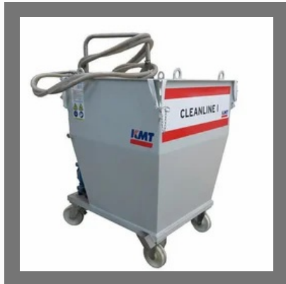
Cleanline I Desludging System