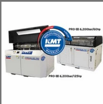
Streamline Pro-III Ultra High Pressure Pumps (6,200 Bar)