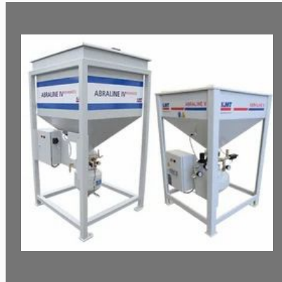
Abrasive Water Jet Cutting Machine