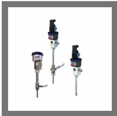
PRO-Series for 6200 Bar