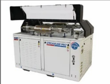
Streamline Pro III 60