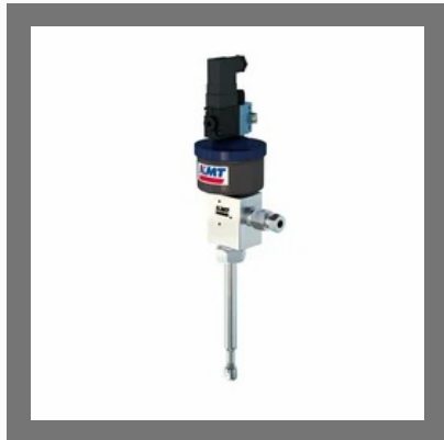
Aqualine Waterjet Cutting Head