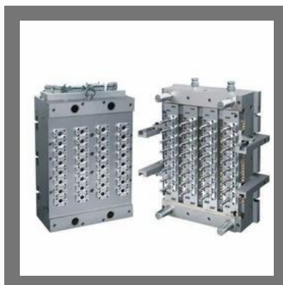
Pet Preform Mould