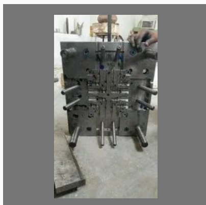
Spray Pump Mould