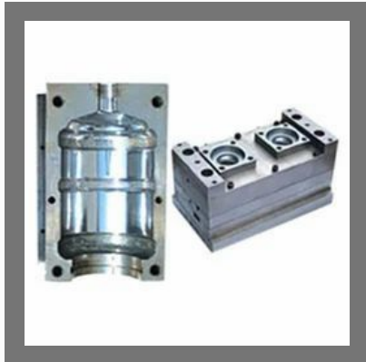
Pet Jar Mold