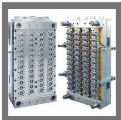
32 Cavity Pet Preform Mold