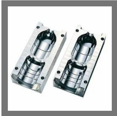
Pet Bottle Mold