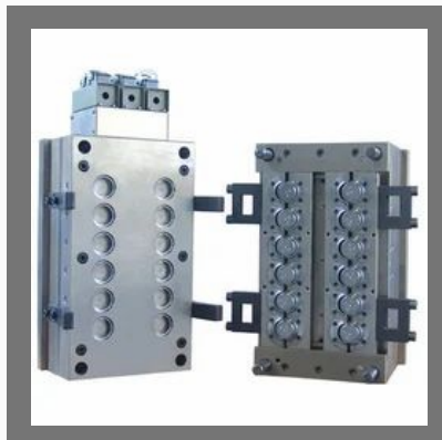
Plastic Cap Mold