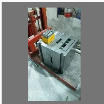
Spray Pump Mould