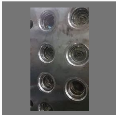
Plastic Cap Injection Mold