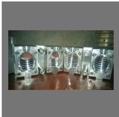
Water Bottle Blow Mould