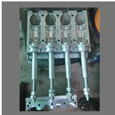
Juice Bottle Blow Mould