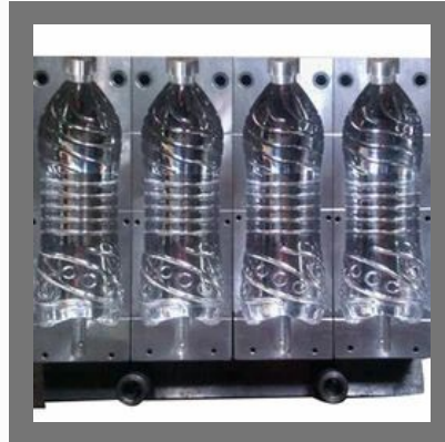
Plastic Pet Bottle Mold (4 Cavity)