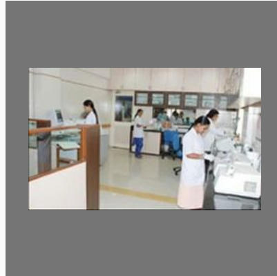
Clinical Pathology Services