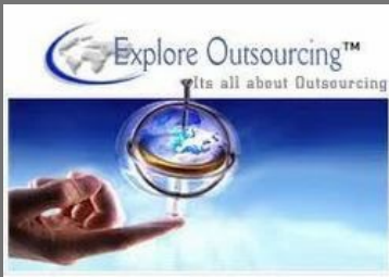
Knowledge Process Outsourcing Services