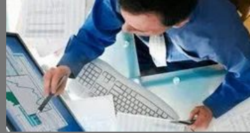
Financial Consultancy Services