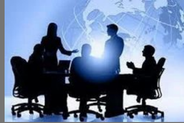
Management Consultancy Services