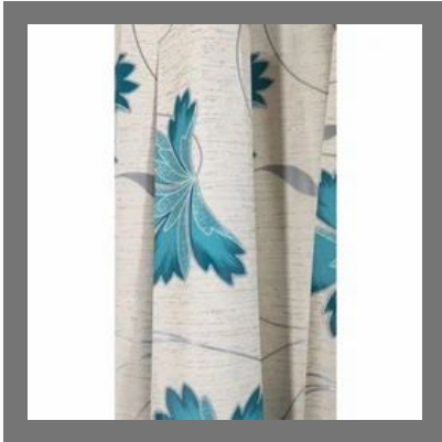
Decorative Printed Wallpaper