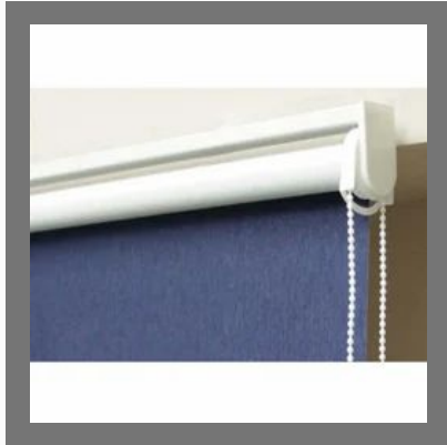
Blind Ball Chain