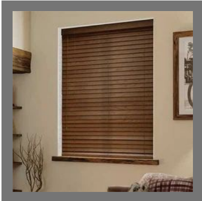
Wooden Window Blind