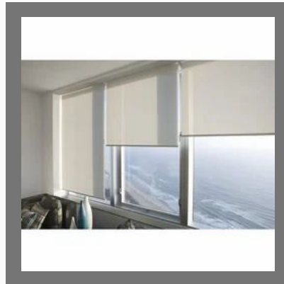
Designer Roller Blinds