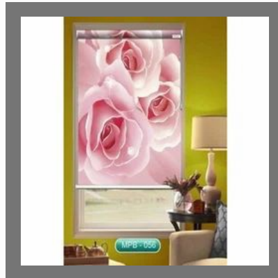
Floral Printed Blinds