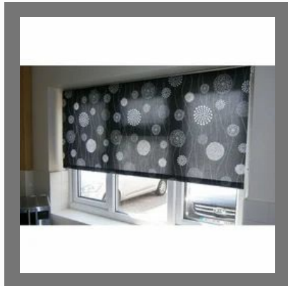
Decorative Roller Blinds