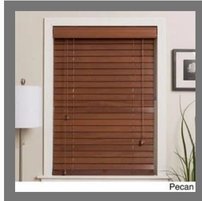
Brown Wooden Window Blind