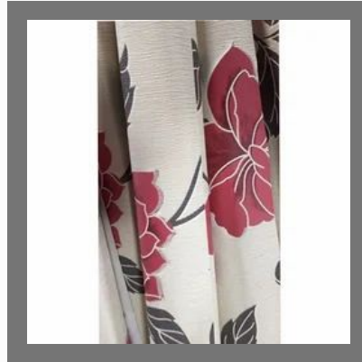
Floral Printed Decorative Wallpaper