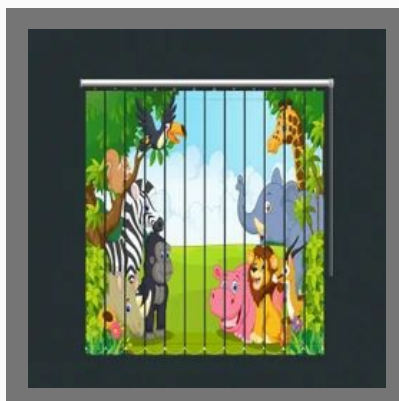
Printed vertical Blind