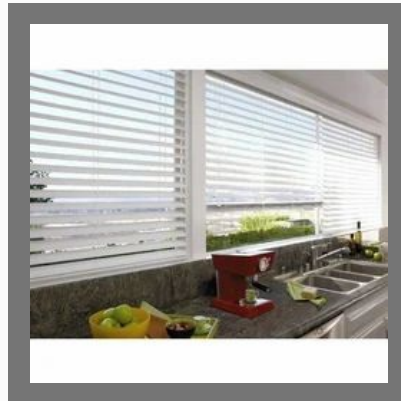
Window Venetian Blind