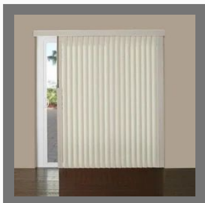
Vertical Window Blinds