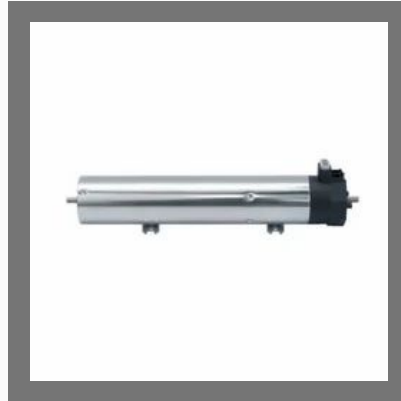
Roller Blind Motor