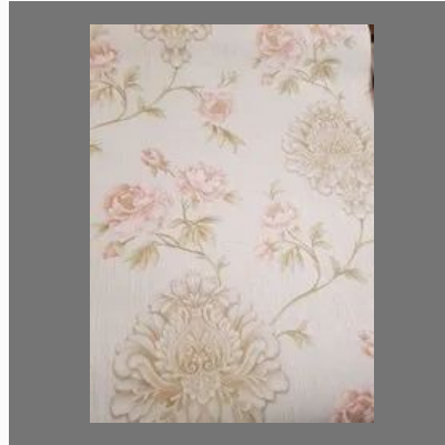
Stock Load Wallpaper