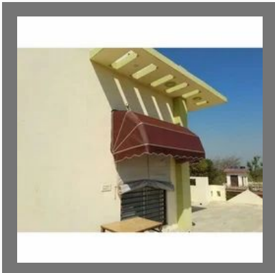
Plain Window Awning