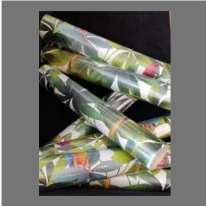
Stock Lot Wallpaper