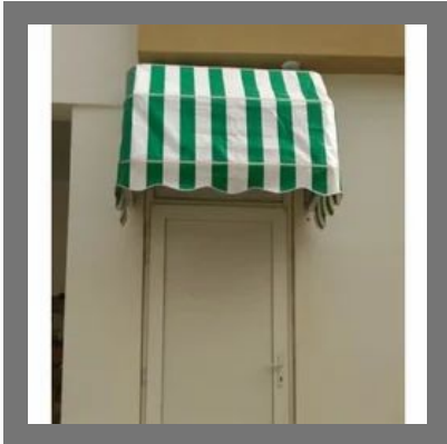
Striped Window Awning