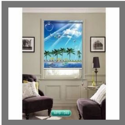
Horizontal Printed Blinds