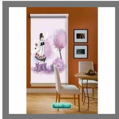
Customized Printed Blinds