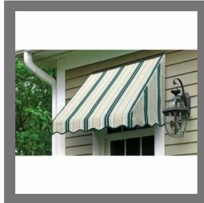
Designer Window Awning