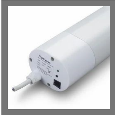
Curtain Motor offer price