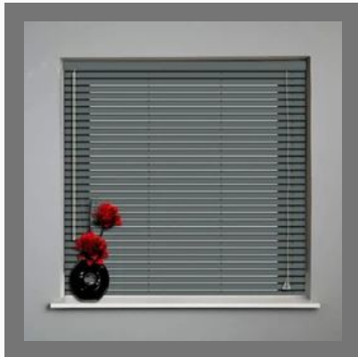
Metal Venetian Blind