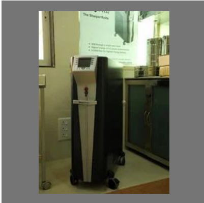
Laser Machine - Auriga XL50 (Star Med-Tech, Germany)