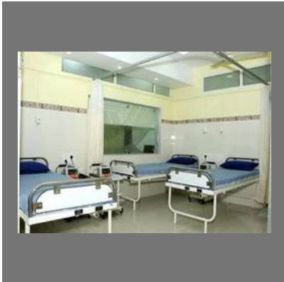
Post Operative Recovery