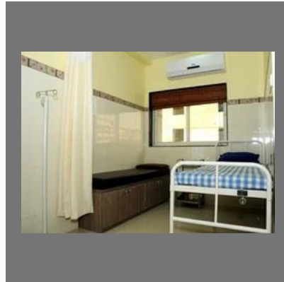
Private Room Ac