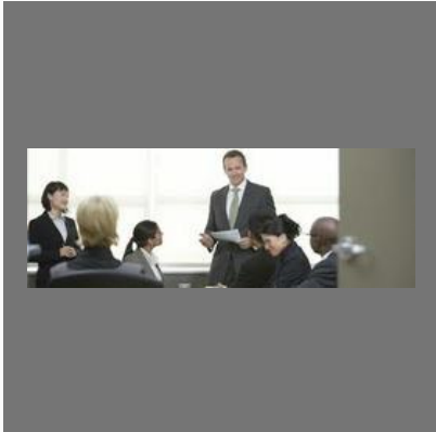
Accounting Advisory Services