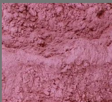
Red Onion powder