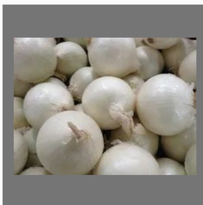
White Onion Flakes/Kibbled