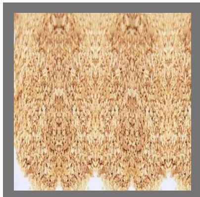
DEHYDRATED GARLIC MINCED