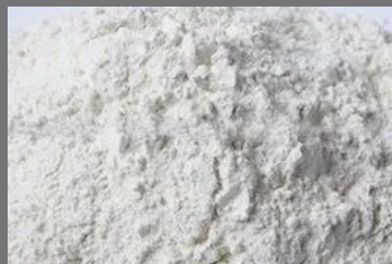
Dehydrated White Onion powder