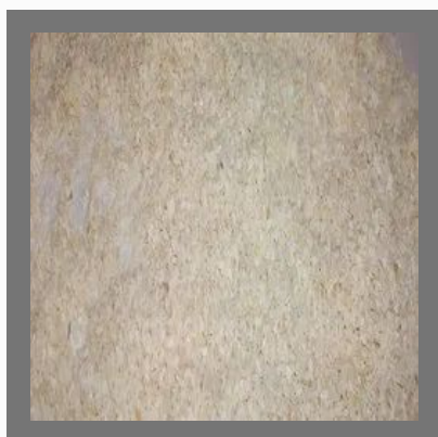
Dehydrated White Onion Minced