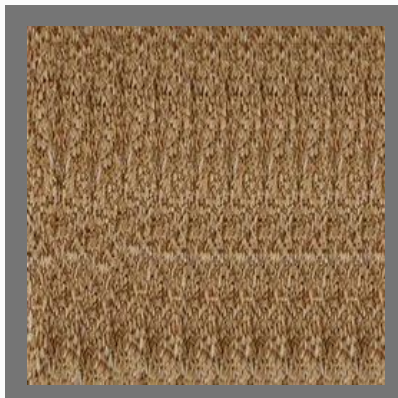
Dehydrated Garlic Granules