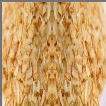
Dehydrated White Onion Granules