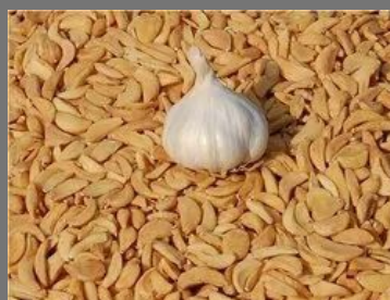
Dehydrated Garlic Flakes