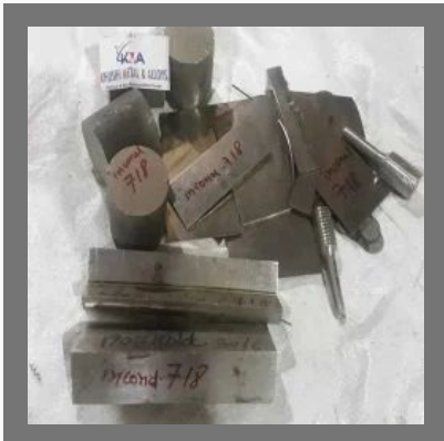
Inconel 718 Scrap