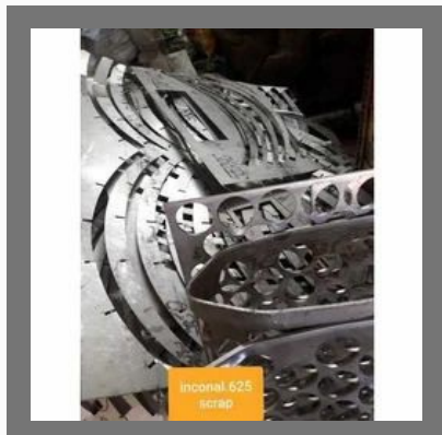
Inconel 625 Scrap