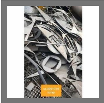
Stainless Steel 309 Scrap