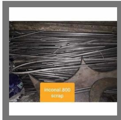
Inconel 800 Scrap