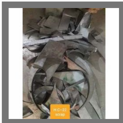
Hastelloy C22 Scrap