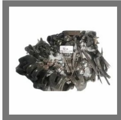
F75 Cobalt Scrap human body parts