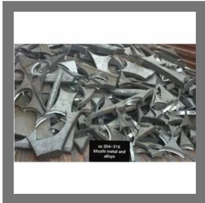
Stainless Steel 304 Scrap