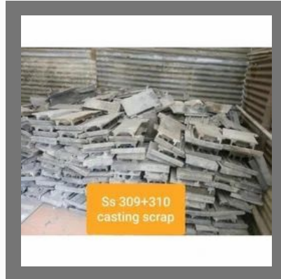
Stainless Steel 309 Or 310 Casting Scrap