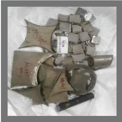
Nickel 200 Scrap