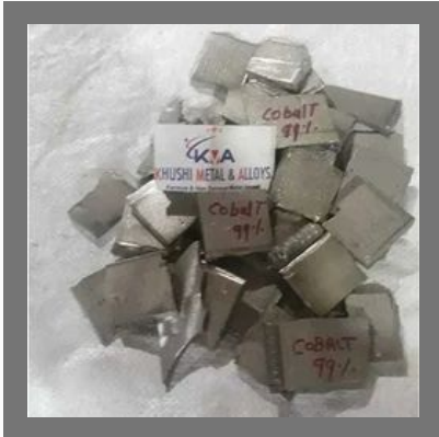
99 % Cobalt Scrap