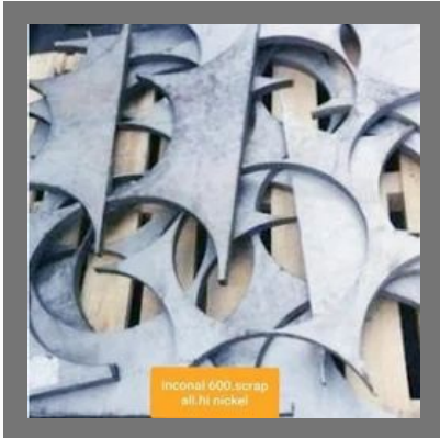
Inconel 600 Scrap