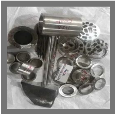
H.S.6 Cobalt Scrap