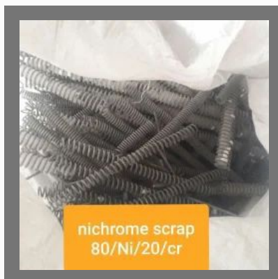
80/20 Nichrome Scrap