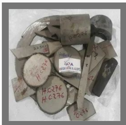
Hastelloy C 276 Scrap