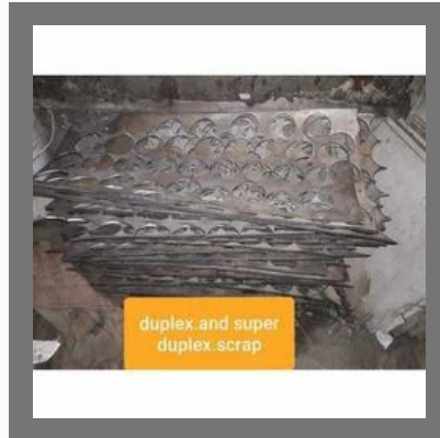
Duplex And Super Duplex Steel Scrap