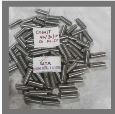
60% Cobalt Scrap & 30% molly & 10% crum