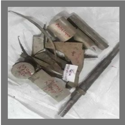
Monel 400 Nickel Scrap