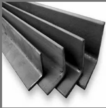
Mild Steel L Angle