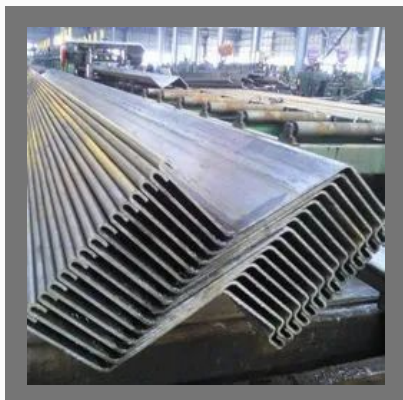
Z Type Steel Sheet Pile