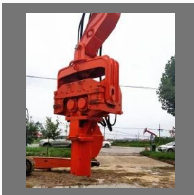
SHEET PILING VIBRO HAMMER MACHINE RENTAL SERVICE