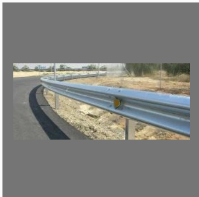
W-Beam Metal Crash Barrier