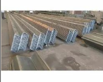
Z Type Sheet Piles