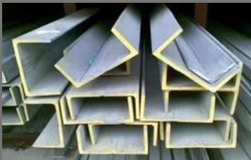
Mild Steel C Shape Channel