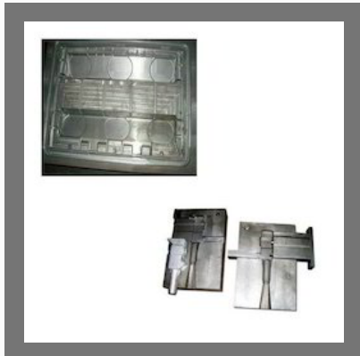
Aluminium Dies for Gravity Die Casting