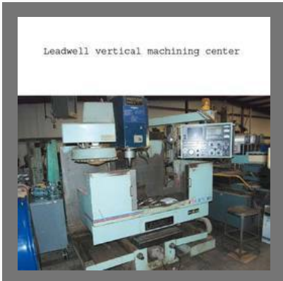
Leadwell Vertical Machining Center