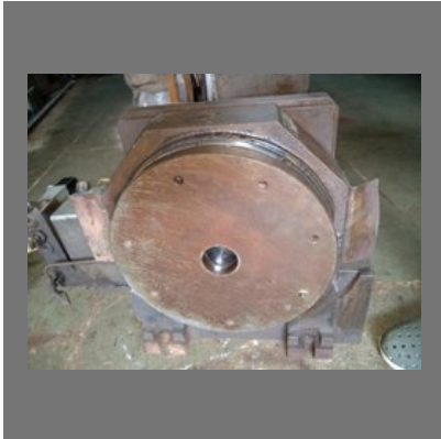
Fibroplan Germany CNC Rotary Table 320 Dia