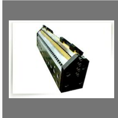
T Die for Plastic Sheet Lines