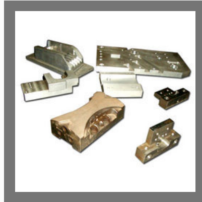
CNC Milled Parts