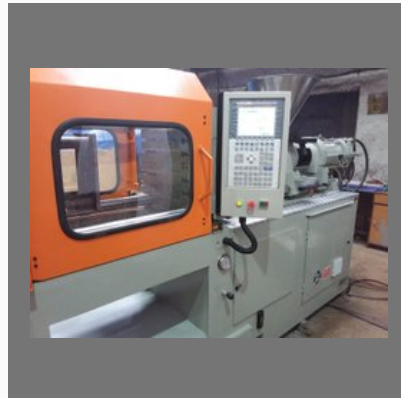
INJECTION MOULDING MACHINE 125 TONS