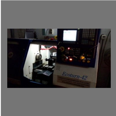
CNC Lathe Job Work