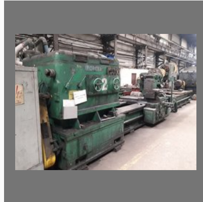
EXTRA HEAVY DUTY POREBA LATHE