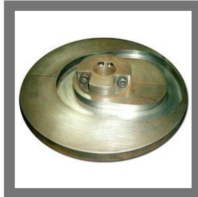
Milled Cams on CNC Milling