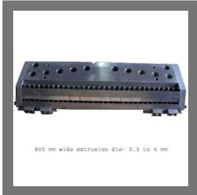
Plastic Extrusion Dies