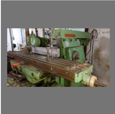
Universal Milling Machines