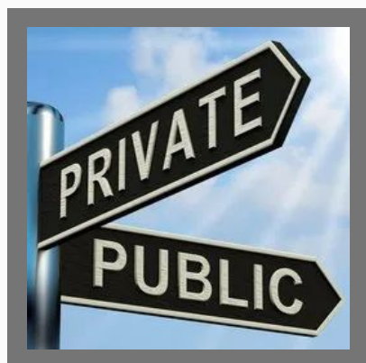
Private Limited Company Registration Services