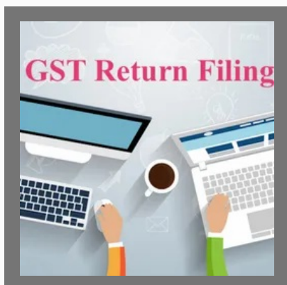
GST Return Filing Service