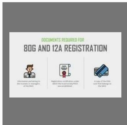
80G And 12A NGO Registration Service