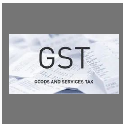
GST Registration Service