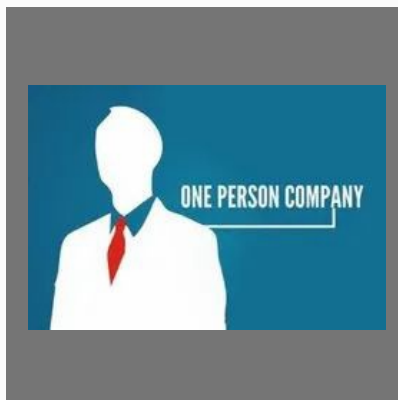
Company Formation Registration Service