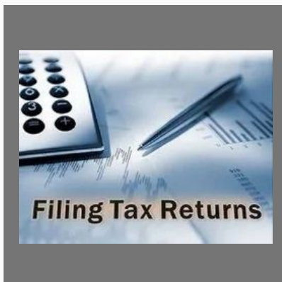
Income Tax Return Filing Services