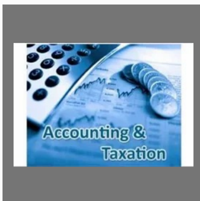
Accounting And Taxation Services