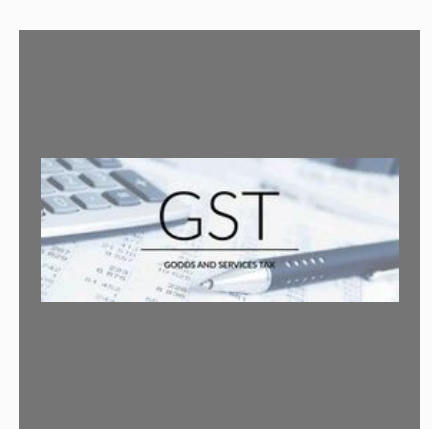
GST Advisory & Compliance Services