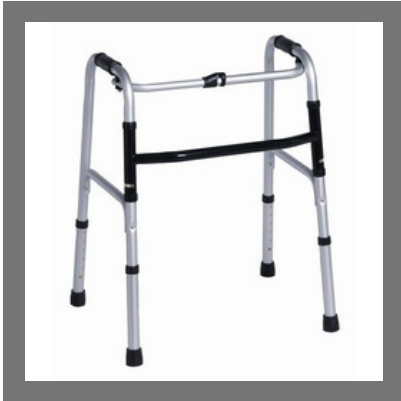
Aluminum Folding Walker