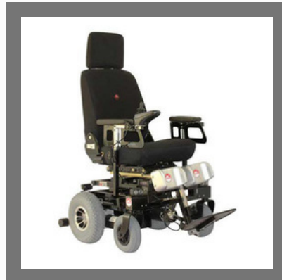
Motorized Electric Wheelchair