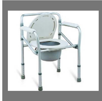
Portable Commode Chair