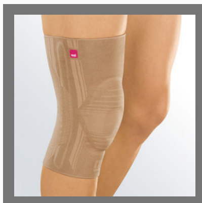
Box Knee Cap