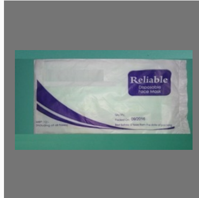
Disposable Face Mask