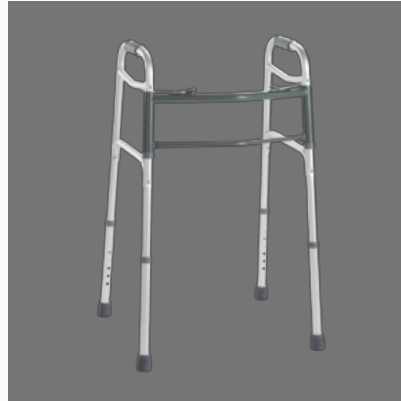
Adjustable Folding Walker