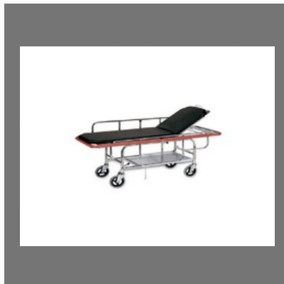
Hospital Hydraulic Stretcher