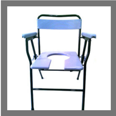
Safe Guard Commode Chair