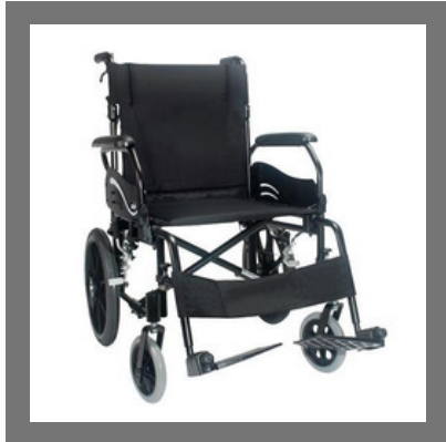
Hospital Commode Wheelchair