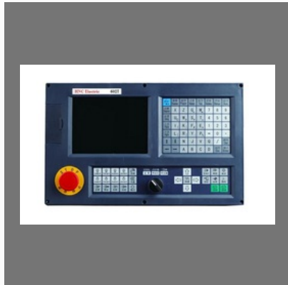
602T CNC Controller For Turning Machine