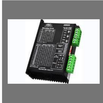
Stepper Drive 2M656