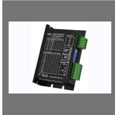
Stepper Drive 2M420