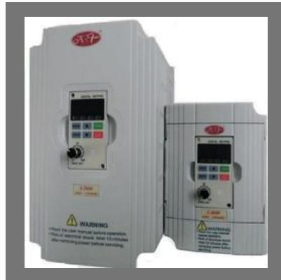
AC Drive KET-3000W3A