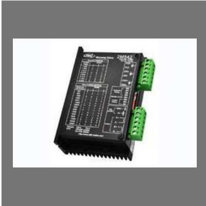
Stepper Drive 2M542