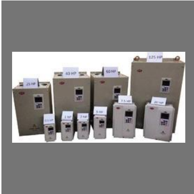
AC Drive KET-3000W1