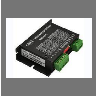
Stepper Drive 2M415