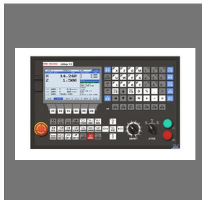
180xp-T3 CNC Controller For Turning Machine