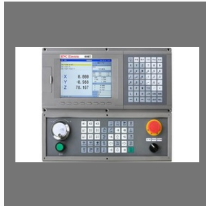
606T CNC Controller For Turning Machine