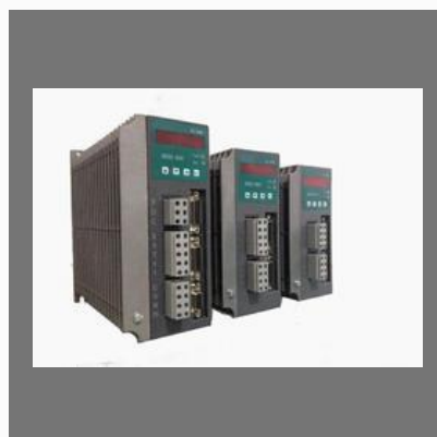
AC 220V Servo Drive