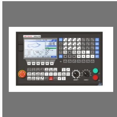
180xp-M3 CNC Controller For Turning Machine