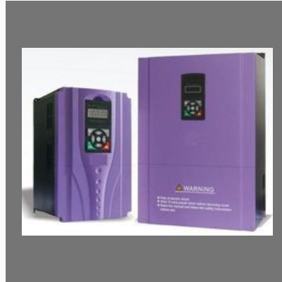
AC Drive KET-3000W4