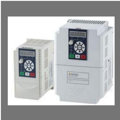
AC Drive KET-3000W4 S-Mini