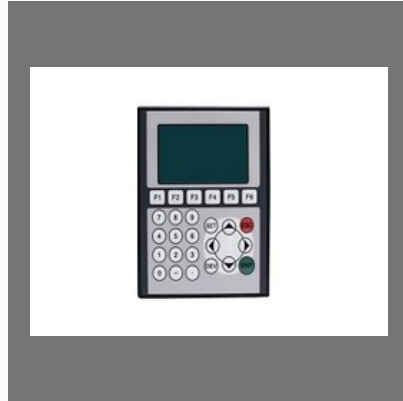
Human Machine Interface