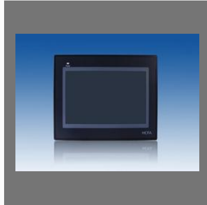
Human Machine Interface