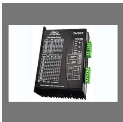
Stepper Drive 2M982