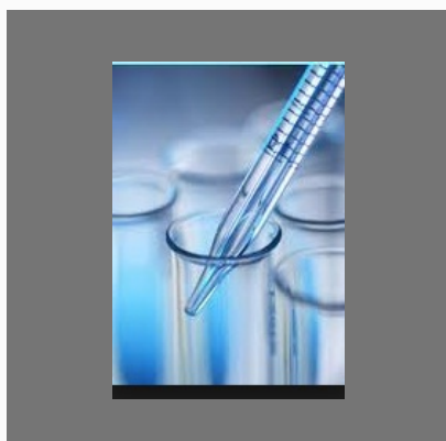
Synthetic Organic Chemistry