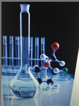
Custom Synthesis Service