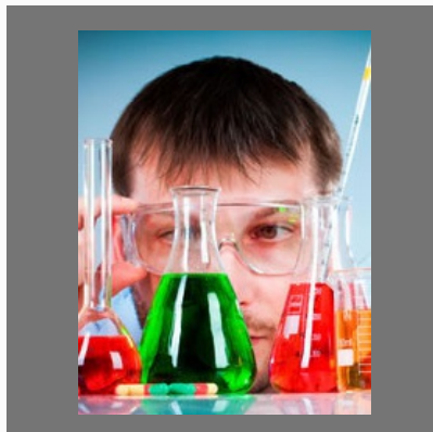
Contract Research & Process Development Services