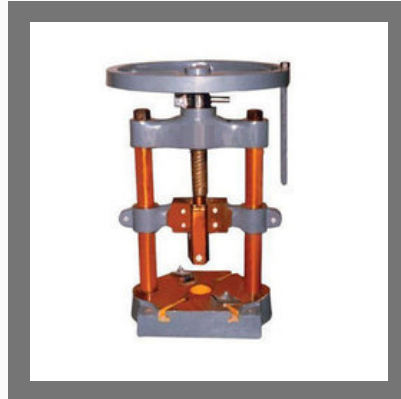
Handpress Paper Plate Making Machine.