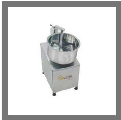
Tapela Bowl Flour Mixing Machine