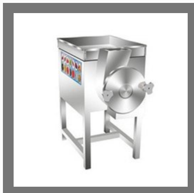
Chilli Cutter Machine