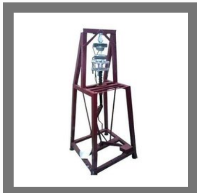
Footpress Paper Plate Making Machine