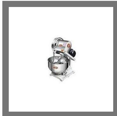
15 Kg Flour Mixing Machine