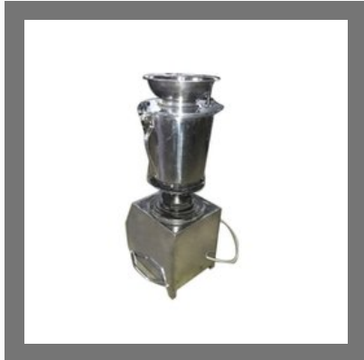
Heavy Duty Mixer Grinder