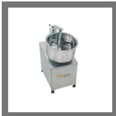
20 kg Flour Mixing Machine