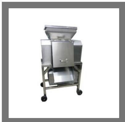
Coconut Cutter Machine