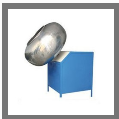
Namkeen Coating Mixing Machine