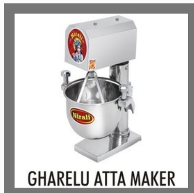
2 Kg Atta Mixer