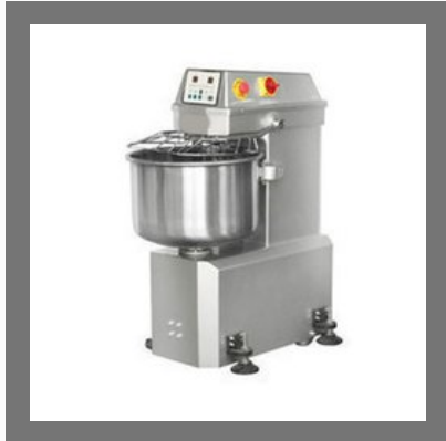
Semi Automatic Flour Mill Machine