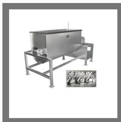
Farshan Mixing Machine