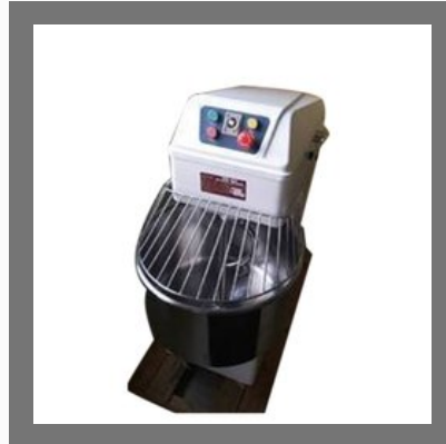
Fully Automatic Flour Mill Machine