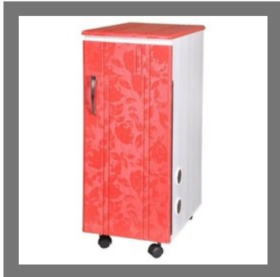
Fully Automatic Domestic Flour Mill Machine