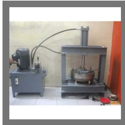
Paper Plate Making Machine