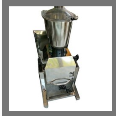
5 Ltr Tilting Mixer Grinder