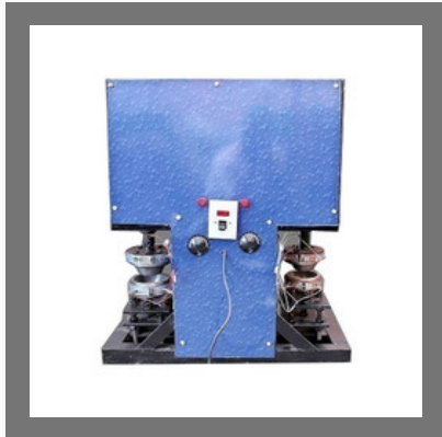
Double Die Paper Plate Making Machine