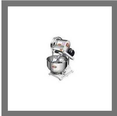
20 Kg Flour Mixing Machine