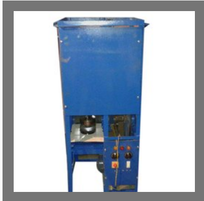
Fully Automatic Single Die Paper Plate Making Machine