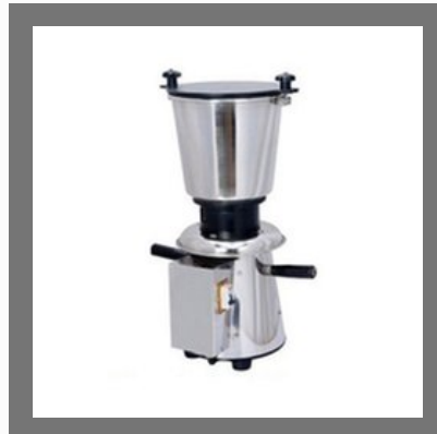
Heavy Duty Mixer Grinder