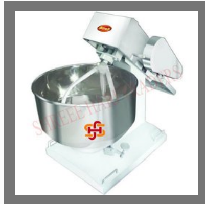
50 kg Flour Mixing Machine