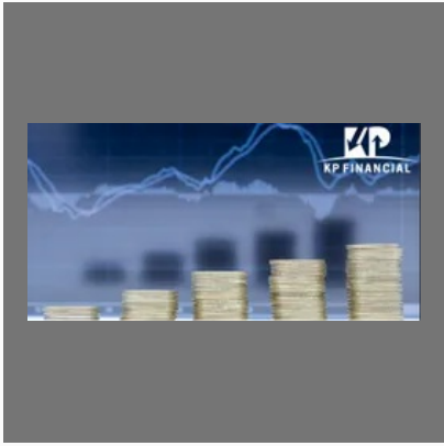
Portfolio Management Service