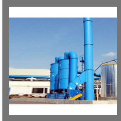
Industrial Wet Scrubber