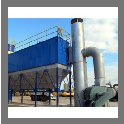
Commercial Dust Collector