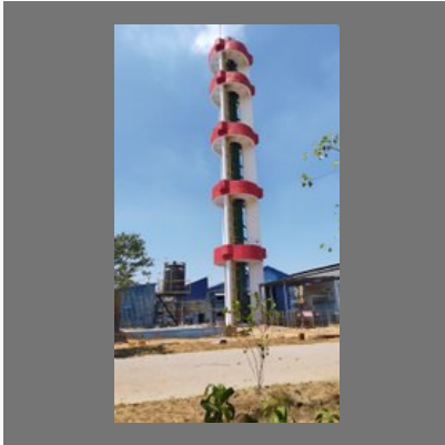
RCC / FRP Chimney