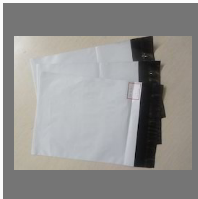
Tamper Evident Packaging Envelope