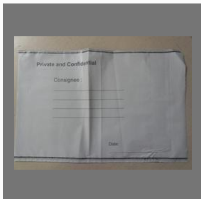
Magazine Book Post Envelope