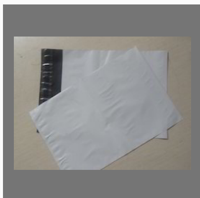
Office Document Envelope