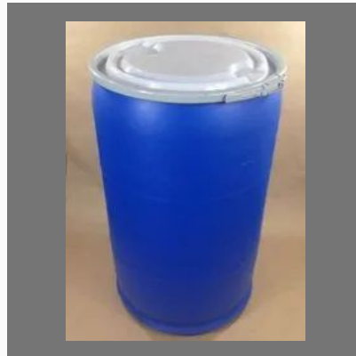
Phenyl Ethyl Alcohol