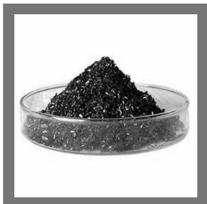
Iodine AR (Resublimed)