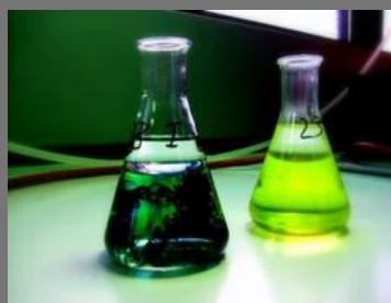
Diethyl Malonate Extrapure