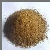
Cupric Chloride Extrapure (Dihydrate)