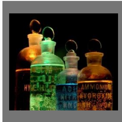
Diethylamine For Synthesis