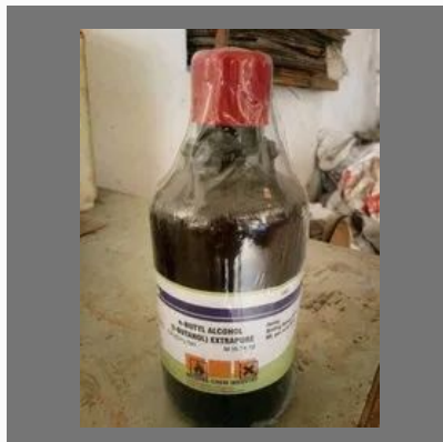
N Butyl Alcohol