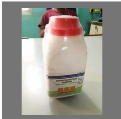
Sodium Thiosulphate Extra Pure