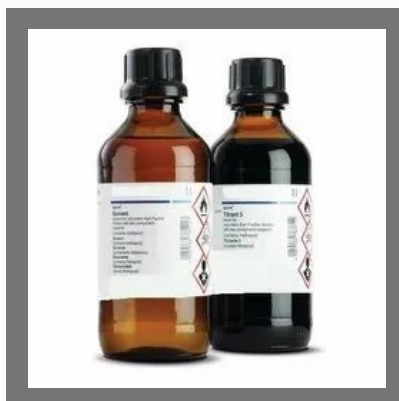
Karl Fischer Reagent