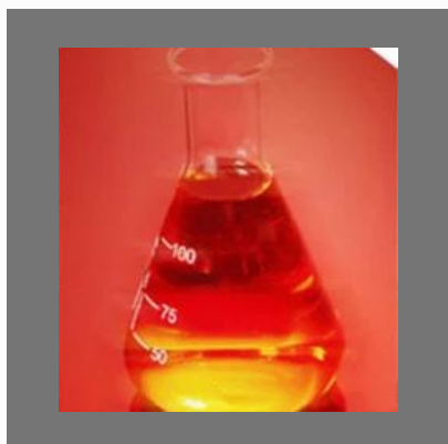
Benzyl Alcohol Extrapure