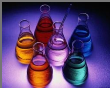
Diethyl Sulphate Extrapure