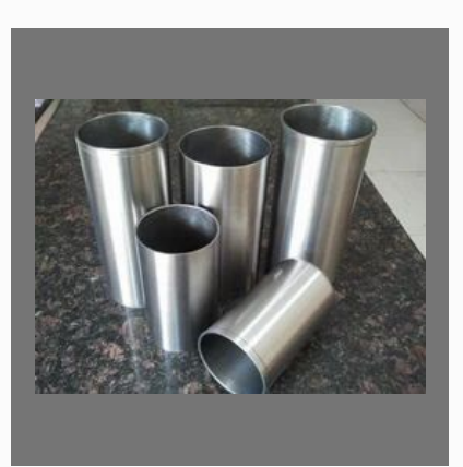
Four Wheeler Cylinder Liner