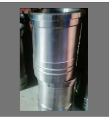
Liner Piston Ring