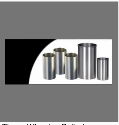
Three Wheeler Cylinder Sleeves