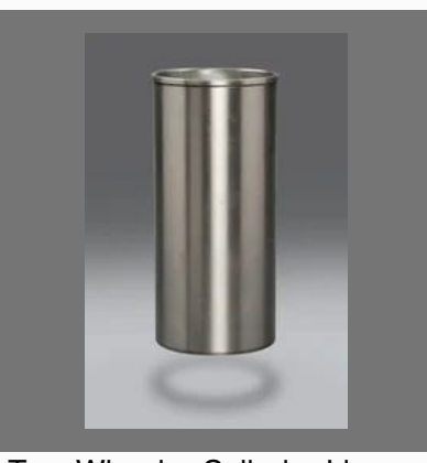
Two Wheeler Cylinder Liner