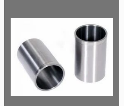
Two Wheeler Cylinder Sleeves