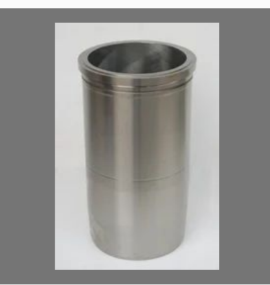
Three Wheeler Cylinder Liner