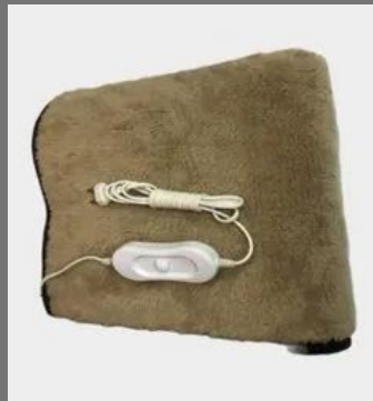
30 X 60 Inches Krien Care Electric Bed Warmer