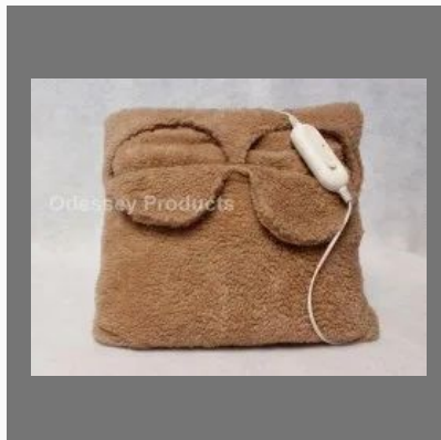
Brown Foot Warmer