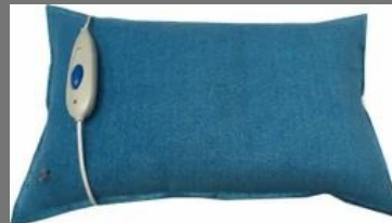
Electric Heating Water Pillow