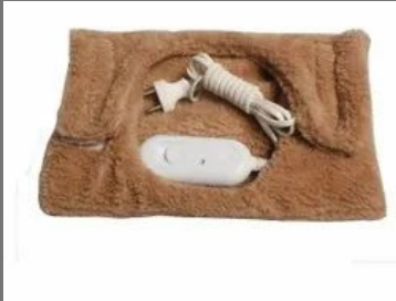
Krien Care Electric Knee Heating Pad