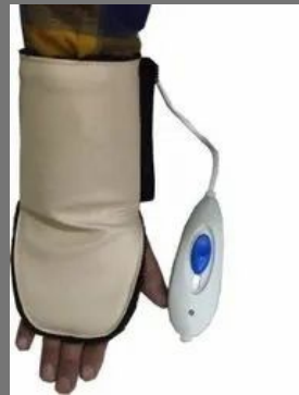
Krien Care Electric Wrist Heating Pads