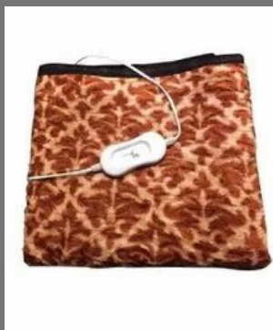
30 x 60inch Printed Brown Krien Care Electric Blanket