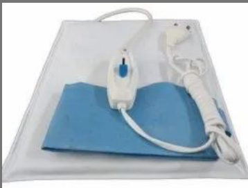
Krien Care Electric Heating Pad