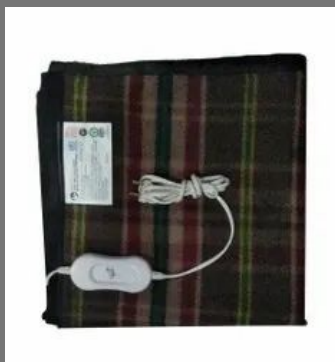
Checked Economy Single Electric Blankets