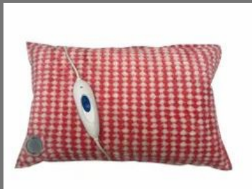
Printed Electric Heating Water Pillow