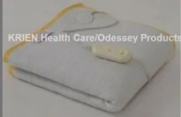
Corporate Electric Blanket