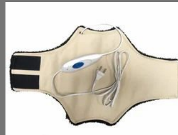
Krien Care Soft Feel Electric Knee Heating Pad