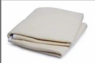
Krien Care Polyester Single Bed Electric Blanket