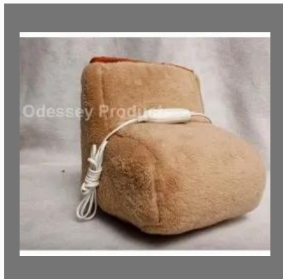
Electric Foot Warmer