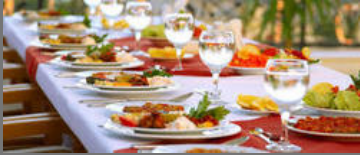
Veg Cuisine Viz