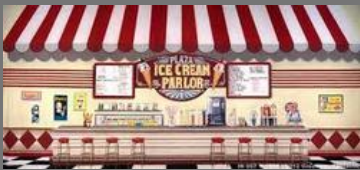
Ice Cream Parlor