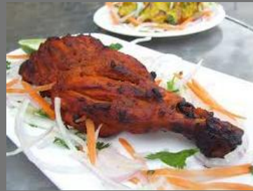
Non Veg Cuisine Viz