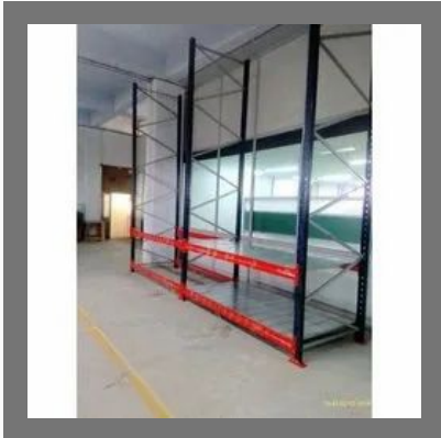
Mild Steel Heavy Rack