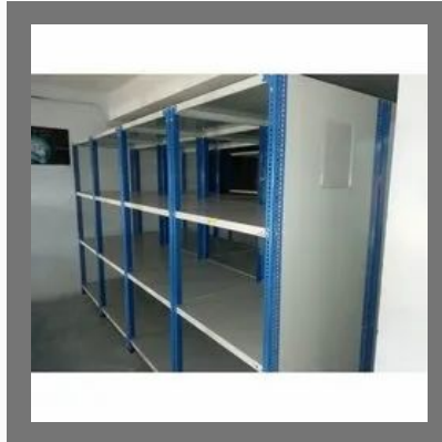
Heavy Duty Pallet Beam Rack