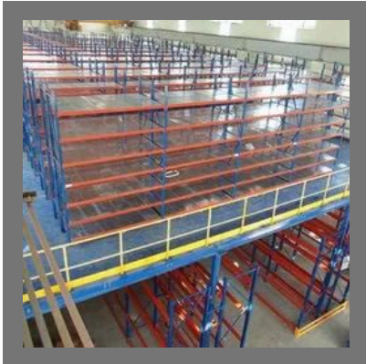
MS Fold Mezzanine Floor