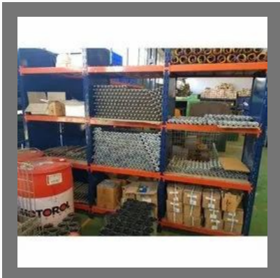
Warehouse Heavy Rack