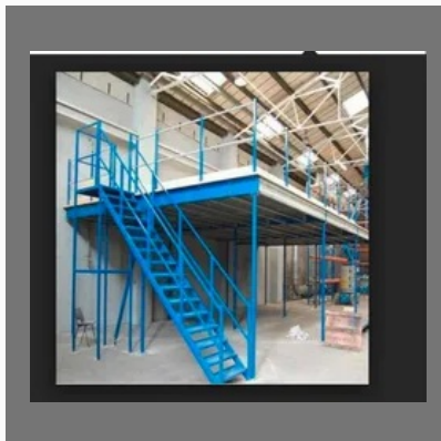
Warehouse Mezzanines Floor