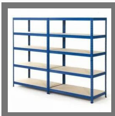
Warehouse Slotted Angle Rack