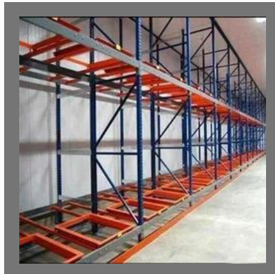
Heavy Duty Warehouse Rack