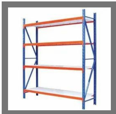
Heavy Duty Racks