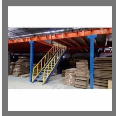
MS Stack Modular Mezzanine Floor