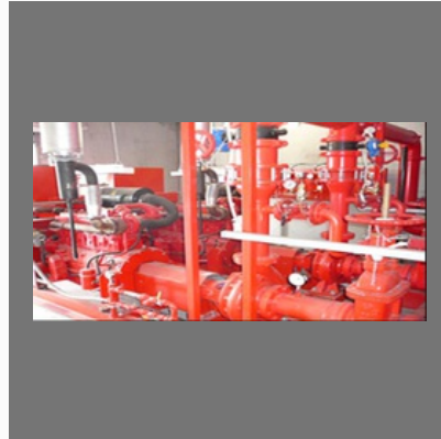
Fire Pumps And Water Tanks