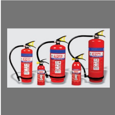
Clean Agent Type Fire Extinguishers