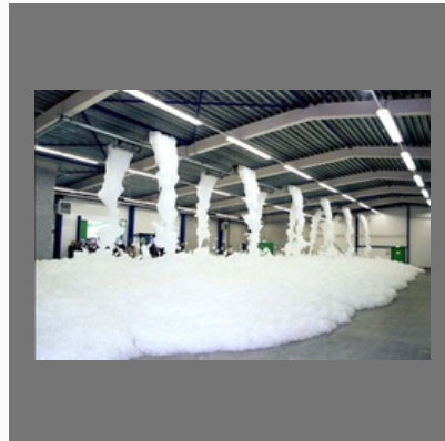
Foam Protection System