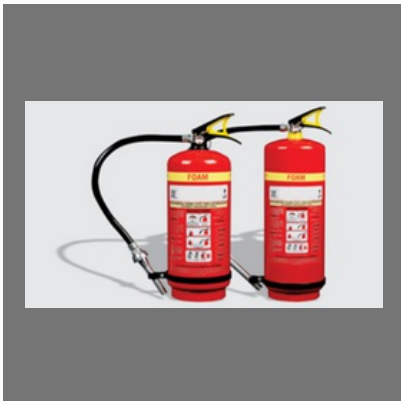
Foam Based Type Fire Extinguishers