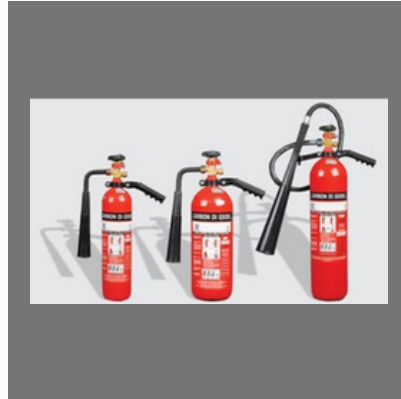
Carbon Dioxide Type Fire Extinguisher