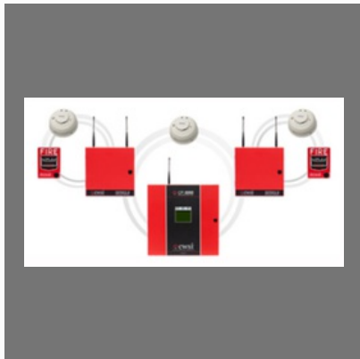
Wireless Fire Alarm System