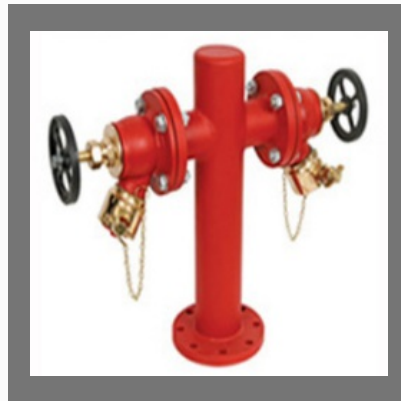
Fire Hydrant And Sprinkler Systems