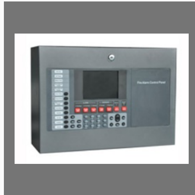
Addressable Fire Alarm System