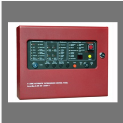
Conventional Fire Alarm System