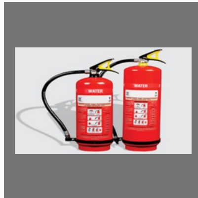
Water Based Type Fire Extinguishers