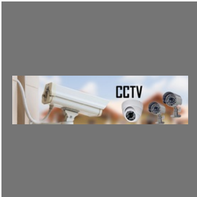
CCTV Security Camera