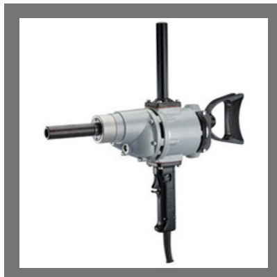
Heavy Duty Drills