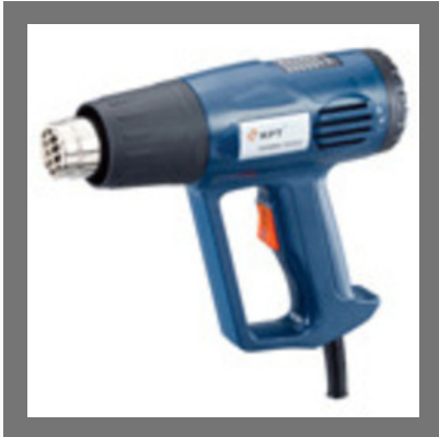
KPT D Handle Heat Gun