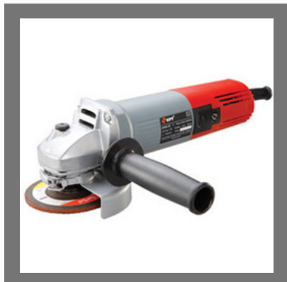
Mini Angle Grinder