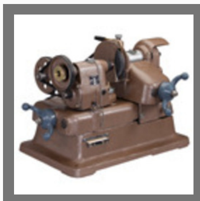
Valve Refacer Machine